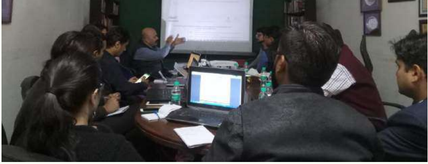
Capital Goods Skill Council conducted a series of capacity building workshop for Assessors and Subject Matter Experts of all the affiliated Assessment Bodies for strengthening and streamlining of the assessment process