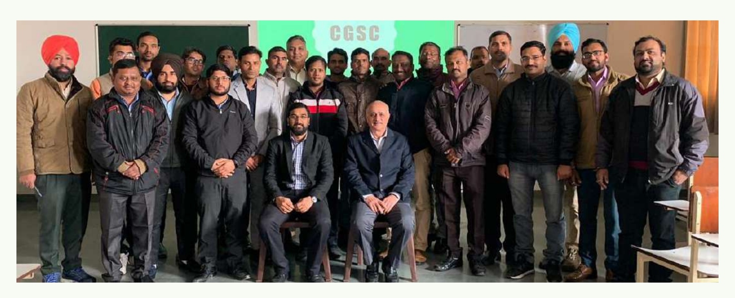
Capital Goods Skill Council conducted Training of Assessor (ToA) workshop for 23 Assessors at Don Bosco Tech Society, New Delhi from 20th Jan to 24th Jan 2020.