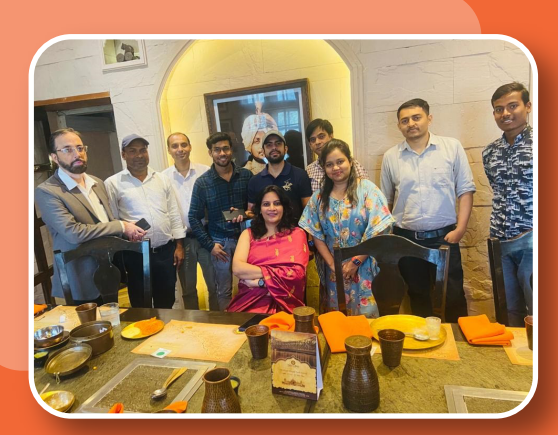
Team Lunch - Diwali Celebration.