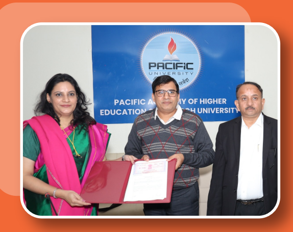
CGSSC signed up an MOU with Pacific University to provide skill based courses to students under the New Education Policy guidelines.