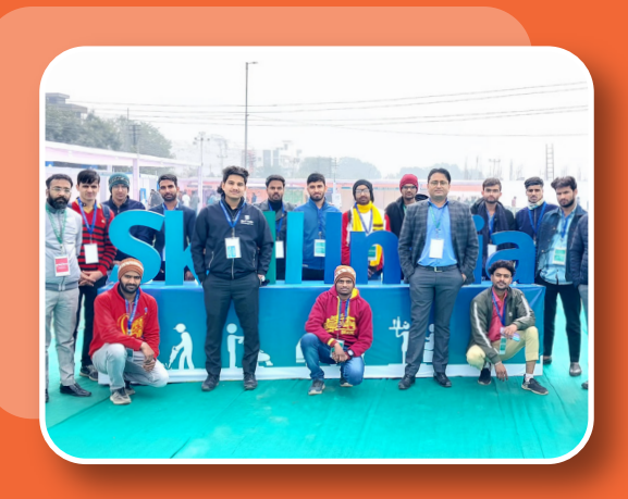
CGSSC participated in Kaushal Mahotsav organized by NSDC in Bundi Rajasthan. Five companies from capital good sector participated and selected 224 candidates.