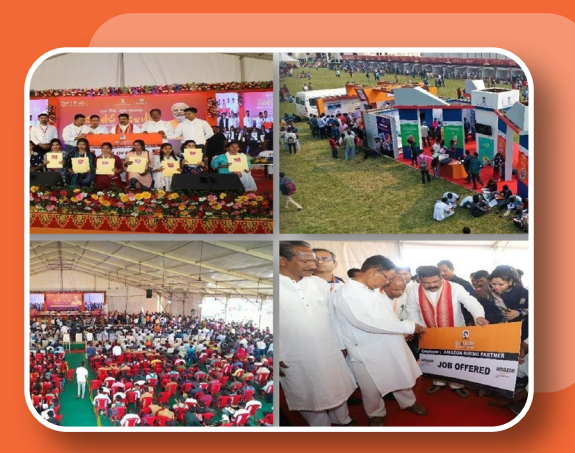
CGSSC participated in Kaushal Mahotsav organized by NSDC in Dhenkanal Orissa.