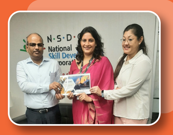
Launch of CGSSC Handbook.