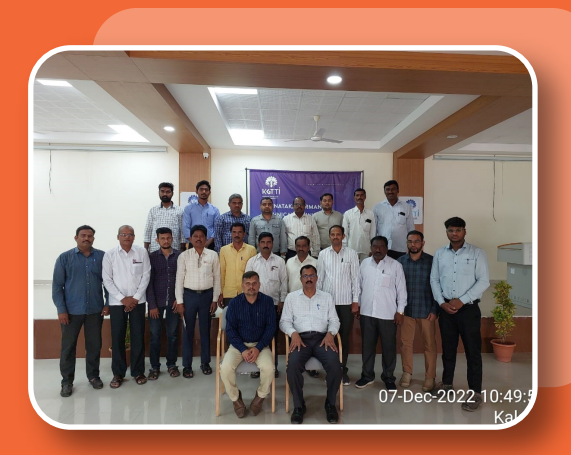
CGSSC in association with leading Skill Training Institutes conducted series of 'Train the Trainer' workshop for trainers in Welding and CNC Milling, CNC programmer and certified 50 trainers across Karnataka Location.